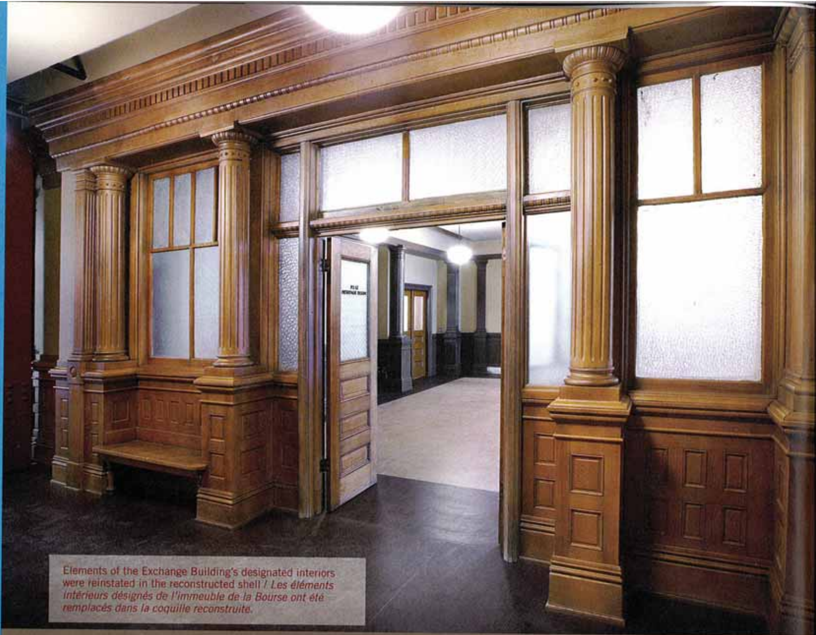
Elements of the Exchange Building's designated interiors were reinstated in the reconstructed shell / Les éléments intérieurs désignés de l'immeuble de la Bourse ont été remplacés dans la coquille reconstruite.

With respect to social justice, heritage conservation: