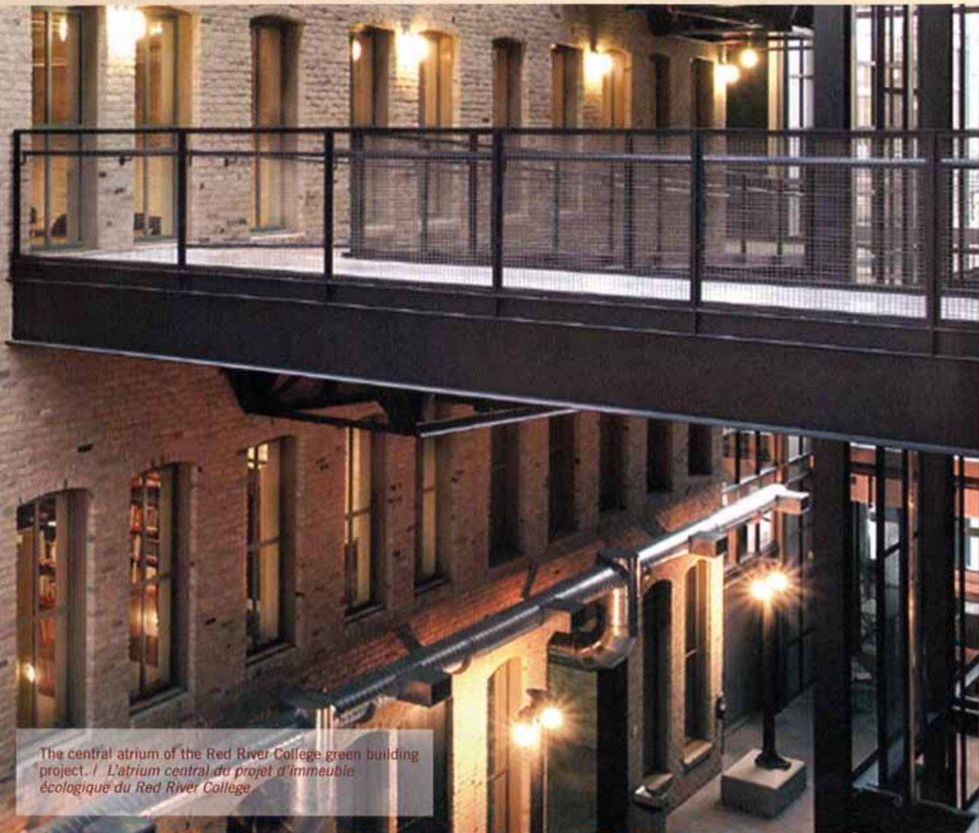
The central atrium of the Red River College green building project. / L'atrium central du projet d'immeuble écologique du Red River College