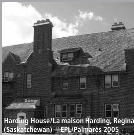
Harding House/La maison Harding, Regina, (Saskatchewan)—EPL/Palmarès 2005