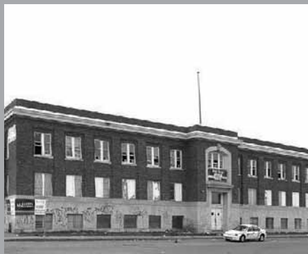
Immigration Hall/Centre d'immigration Edmonton (Alta./Alb.)—EPL/Palmarès 2005

We are making a difference with your support.