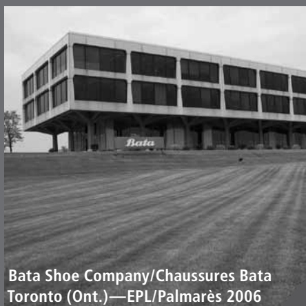
Bata Shoe Company/Chaussures Bata Toronto (Ont.)—EPL/Palmarès 2006

En 2005, la FHC a entamé la tradition d'attirer l'attention du Canada sur les 10 sites historiques les plus menacés à l'échelle nationale. En plus des sites qui y figurent, 33 autres continuent de faire face à un avenir incertain.