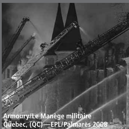
Armoury/Le Manège militaire Quebec, (QC)—EPL/Palmarès 2008